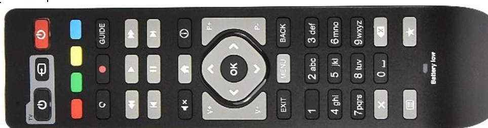
integrated TV remote control