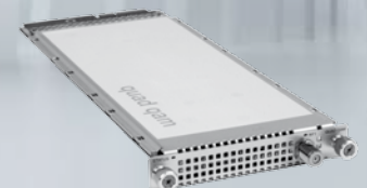
Quad QAM Modul