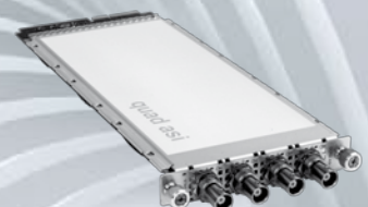
Quad DVB-ASI Module.