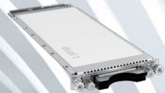
Dual DVB-T Module with Dual Common Interface Module (optional) Installed.