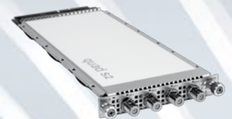
Quad DVB-S2 (S) Module.